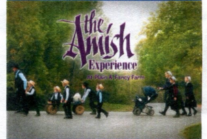
Experience the Amish lifestyle