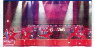
Enjoy the "BRITAIN'S BEST" Show at the American Music Theatre