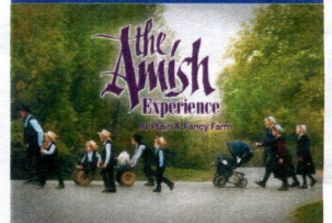
Experience the Amish lifestyle