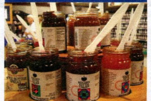
Enjoy a Taste of Local Jams

Departure: Cantiague Park, 480 W. John Street, Hicksville, NY @ 8 am